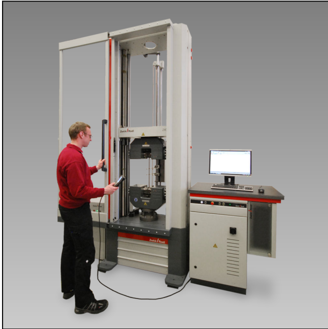
Z400E with hydraulic grips